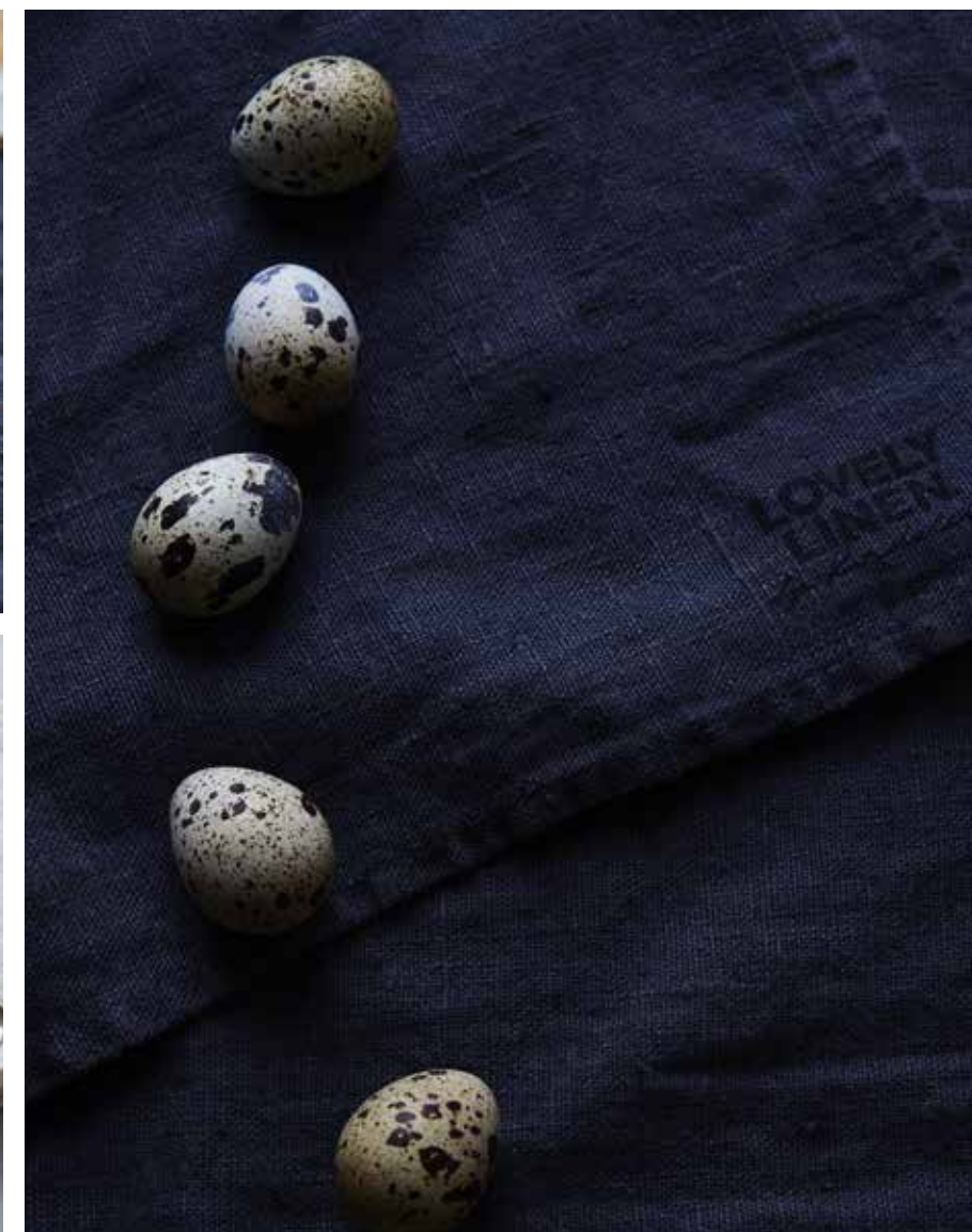
BEAUTIFUL, WRINKLED LOOK OF NATURAL LOVELY LINEN. GREAT ABILITY TO ABSORB AND LOSE WATER RAPIDLY MAKES IT A STYLISH, MUST-HAVE PARTNER IN THE KITCHEN.