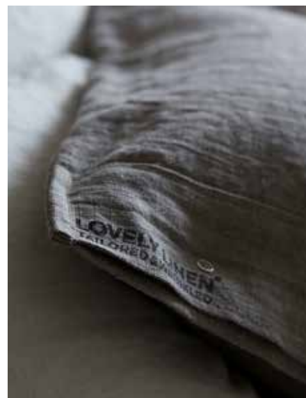
BEAUTIFUL AND COZY. THE SOFT TEXTURED FEEL OF OUR LOVELY LINEN IS AN ABSOLUTE DREAM TO SLEEP IN AND A PLEASURE TO WAKE UP TO IN THE MORNING.